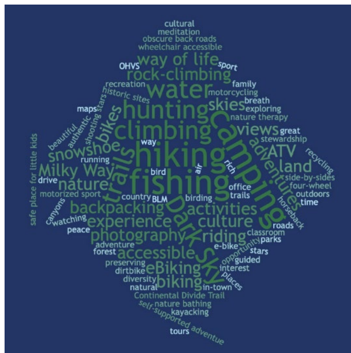
Figure 6 – Workshop participant responses to the question "What does outdoor recreation mean to you?"