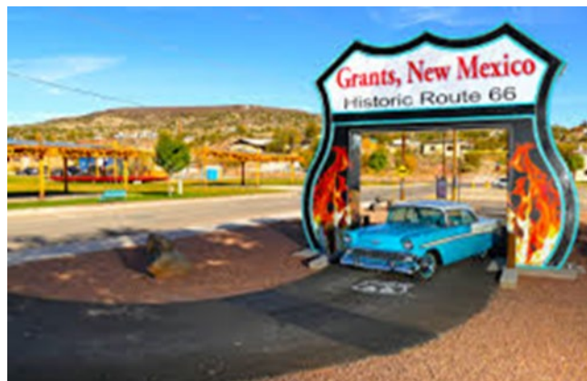
Historic Route 66 Sign