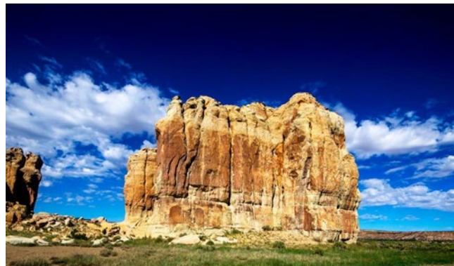
El Malpais National Monument

To build upon this project, the City of Grants and Cibola County applied for the U.S. Environmental Protection Agency's (EPA) Recreational Economy for Rural Communities (RERC) program in 2019 and was one of ten finalists selected out of 170 applications nationwide. RERC planning assistance will help the County diversify its economy, become a more environmentally sustainable community, and