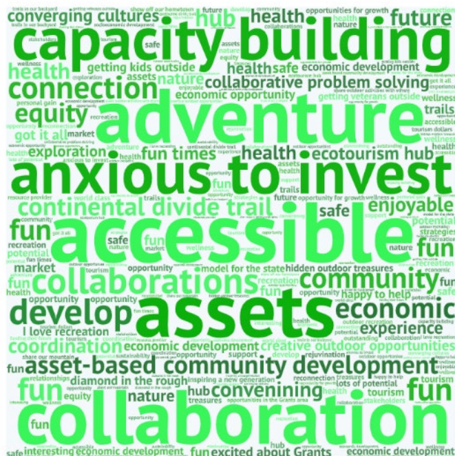
Figure 5 – Workshop participant responses to the question "What most excites you about Grants and outdoor recreation?"

Downtown revitalization and entrepreneurship training were the main themes in the Marion, VA case study. Marion, VA is a small town with 6,000 residents located in southwest Virginia that hosts free five-week small business boot camps where entrepreneurs can access training on finance, marketing, and customer service. The goal of the program is to lower downtown retail vacancy rates. Since the program's inception in 2012, 275 entrepreneurs have been trained, leading to 30 new businesses employing 118 people and attracting over $2.1 million in private reinvestment in town.