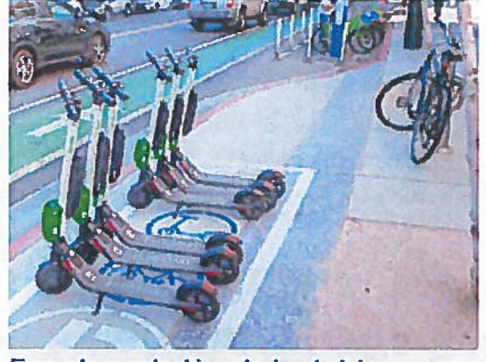
E-scooters parked in a designated drop zone

HEPH is leading a working group comprised of staff from FHWA, Federal Transit Administration, National Highway Traffic Safety Administration, and U.S. DOT's Office of the Secretary and Intelligent Transportation Systems Joint Program Office to coordinate and advance the Department's research endeavors on the swiftly emerging field of micromobility. HEPH staff are engaging staff across the Department to track existing research and develop a multi-year micromobility research roadmap. Coordination with the working group also helped to identify prioritized micromobility research topics in the areas of safety and infrastructure, equity, resiliency, user behavior, and curbside management. Additionally, there is research underway on ebikes,