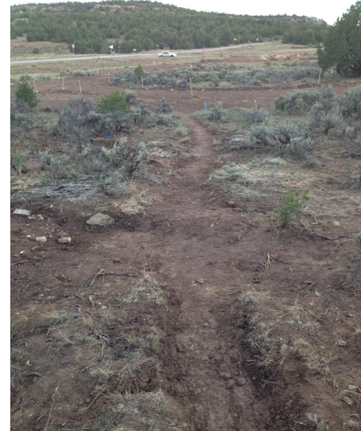
Eastside Connector from the Milk Ranch Trailhead.