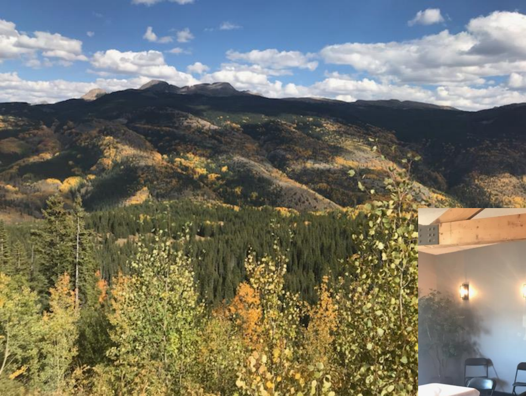
Early Fall in the Southern Rockies.

Intensified drought patterns are of concern throughout the West, where future projections of sustainable water supply are increasingly pessimistic.