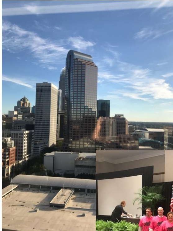
Downtown Charlotte, North Carolina