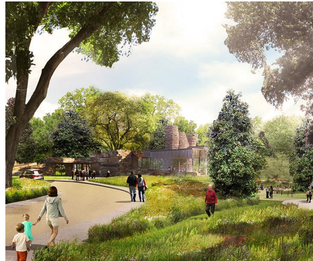
The Gathering Place for Tulsa [artist's rendering]

"Four Corners Future Forum 2.0" was held at San Juan College on November 1, 2018, with over 50 in attendance – following up on the successful "Forum 1.0" held a year ago. Going forward, implementation priorities will include focused work on regional broadband/connectivity and regional branding/marketing, with collaborative efforts also continuing in regional food systems and other development sectors.