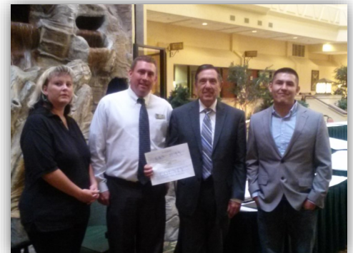
San Juan County: Lower Valley Senior Center

Congratulations to the City of Gallup and San Juan County!!!