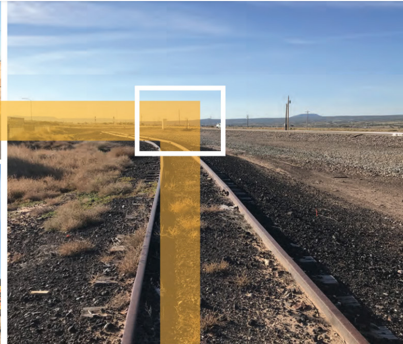
Milan Industrial Park