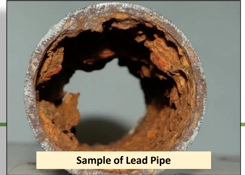
Sample of Lead Pipe

Presented by COG's Regional Water Planning Organization (RWPO)